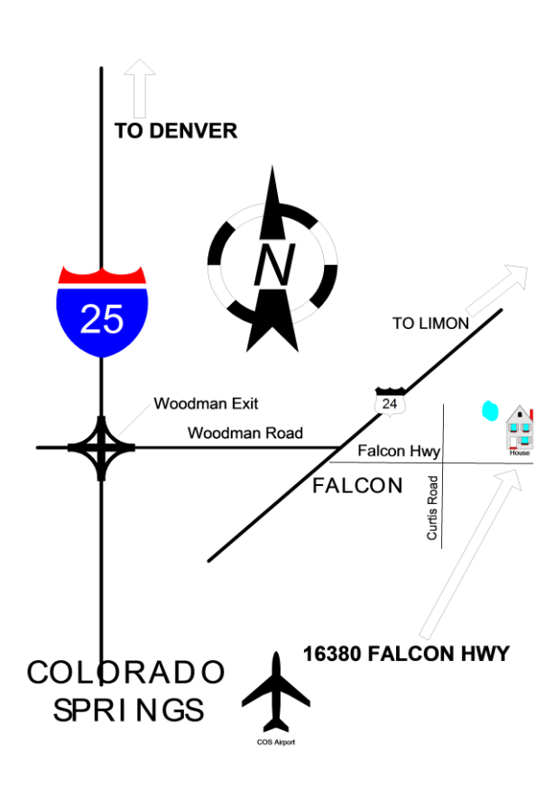
From I-25 North or South: Take Woodmen Road Exit and travel east to Highway 24. Turn Right on Highway 24 and then turn Left on Meridian. Go to stop sign and then Turn Left on Falcon Highway. Turn Left in drive way at 16380 Falcon Highway.